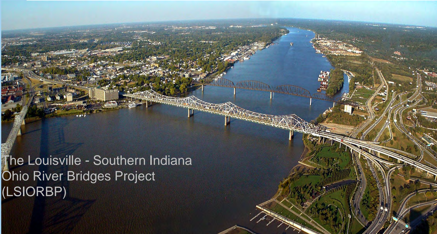
The Louisville - Southern Indiana Ohio River Bridges Project (LSIORBP)